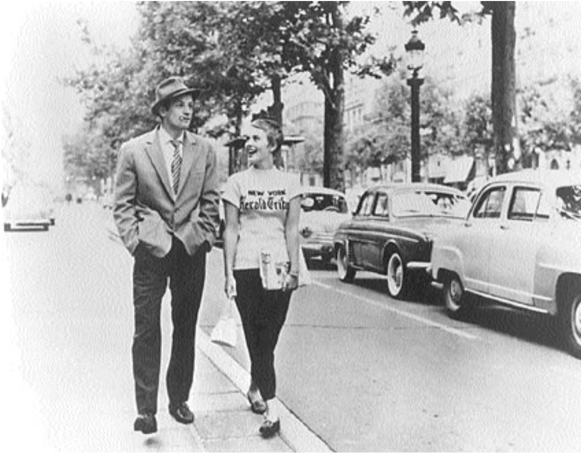
Jean-Paul Belmondo and Jean Seberg as lovers strolling down the Champs-Élysées in Breathless (1959), directed by Jean-Luc Godard.

kept the audiences constantly aware that they were being presented with a report of past events. As historical reconstructions his plays openly declared the stage as just a stage, and not a place to be mistaken for the actual world itself. The main function of the enactment was to produce living illustrations that could foster a critical attitude in the audience in hopes of changing the powerful social, economic and historical forces operating upon people's lives.