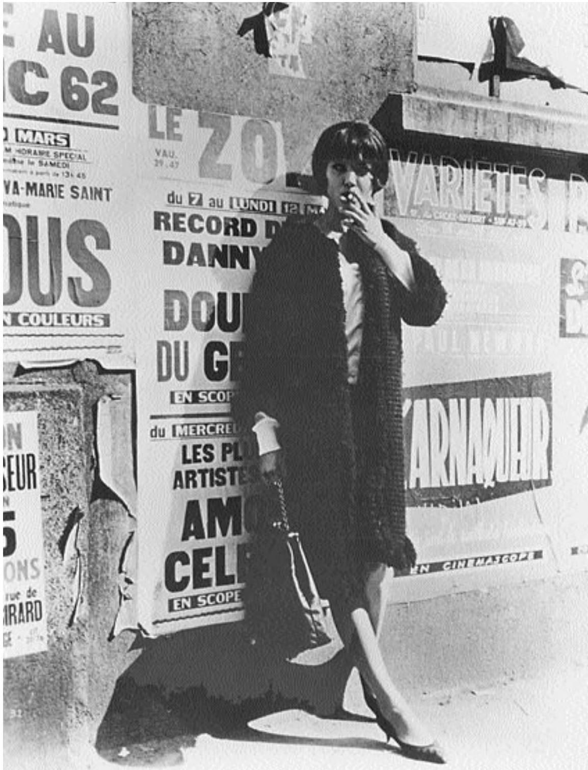
Anna Karina plays a prostitute in a series of Brechtian episodes detailing her lifestyle in Godard's Vivre Sa Vie / My Life to Live (1962).