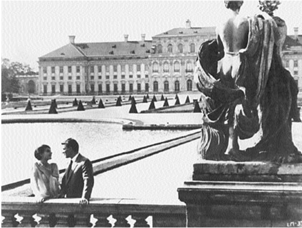
Alain Resnais in Last Year at Marienbad (1961) uses shots of gardens and statues of a hotel where remembrances of times past confuse time present.

slaughterhouse that becomes an allegory of the Nazis and their butchery of French Resistance fighters. His other short films, one on Georges Méliès, the other on Madame Curie, deconstruct myths about heroism and heroes. His first feature film, La Tête Contre les Murs / The Keepers (1958), a partly surreal documentary on the French insane asylums, is cited as a forerunner of New Wave attacks on traditional institutions and structures that Michel Foucault revisits in his account of mental institutions in Madness and Civilization (1965/1981).