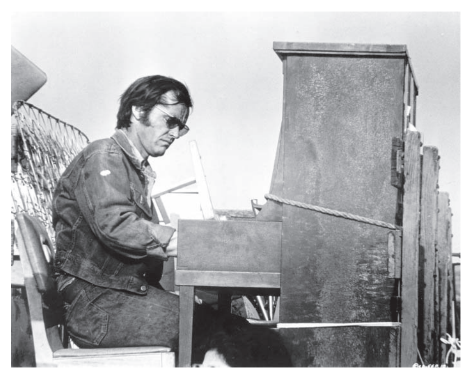
Figure 2. Professional cultural capital in a blue-collar setting: Bobby Dupea (Jack Nicholson) plays Chopin on the back of a truck in Five Easy Pieces (Bob Rafelson, 1970).

The withholding of information about Bobby's past—a sort of diegetic inversion of cause and effect—characterizes the narrative strategy of the film as a whole. This apparent violation of classical Hollywood's linear, causally motivated narration—described by Peter Wollen, in another context, as "narrative intransitivity" is a signal feature of what many film theorists and historians have come to call postclassical or New Hollywood filmmaking. It was this narrative intransitivity that was consistently praised by the film's many enthusiastic reviewers. In a typically glowing review of the film, Jacob Brackman, writing for Esquire , cited this scene as "the first in a series of astonishing fake-outs" that helped make Five Easy Pieces "the opposite of a genre film," in that the viewer is offered "what you least expected and therefore most hoped to see." Similarly, Richard Schickel wrote in Life that the film "totally reverses our cinematic expectations":