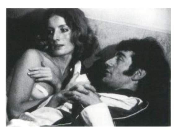
The Loves of Ondine