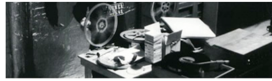
Warhol at work