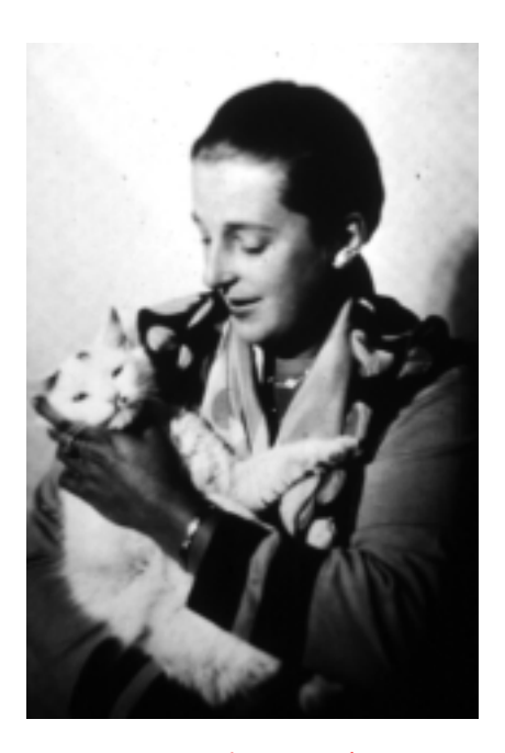
Lotte Reiniger's Introduction to The Adventures of Prince Achmed

For Centuries Prince Achmed on his magic horse had lived a comfortable life as a well-loved fairy tale figure of the Arabian nights and was well contented with that. But one day he was thrown out of his peaceful existence by a film company which wanted to employ him and many other characters of the same stories for an animated film. For this purpose he had to be recreated like