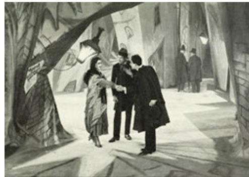
The Cabinet of Dr. Caligari