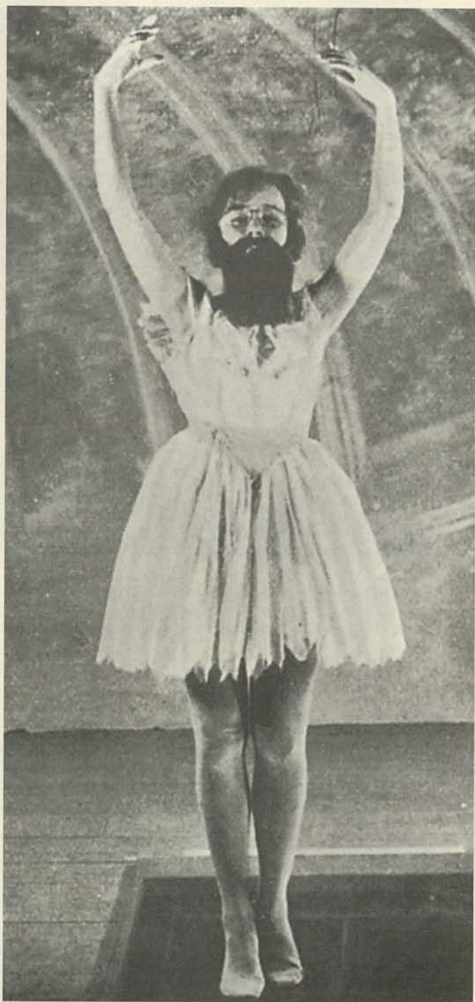
Rare René Clair's Entr'acte (1924) is a short film filled with editing sequences that serve Dada's goals of breaking away from "logic." In this sequence a ballerina is revealed to be a bearded man dancing in a tutu.

Another non-narrative experimental film that contains absurd humor and surreal displacements is Ballet Mécanique (1924). This experimental film was designed and directed by Fernand Léger to demonstrate his fascination with the spirited interplay of industrial forms and