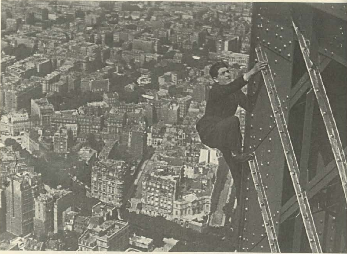
The fantasy begins in René Clair's Paris qui Dort (1925) when Dr. Craze uses a paralyzing ray machine to stop time. A few people escape the rays and decide to meet on the Eiffel Tower.

picture, it always contained illogical juxtapositions to other images to demonstrate a magical, irrational, hallucinatory, dream-like quality in the free association of forms. The surrealist approach to filmmaking was designed to shock the viewer by this visual displacement rather than to establish any logical or plausible explanation of the actions within the context of the scene.