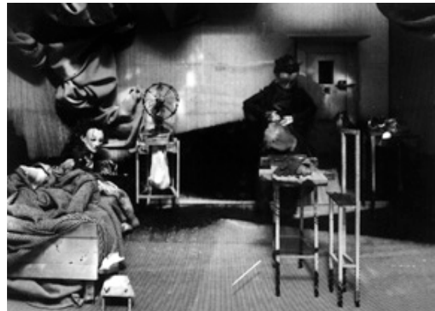
Rehearsals for Extinct Anatomies

In approaching psychoanalysis through puppetry, the brothers by default deal with the quality fundamental to an experience of the uncanny: the blurring of the distinction between the animate and the inanimate. Streets of Crocodiles (1987) begins with a very important scene in which the hand of a human figure liberates a puppet, and its surrounding objects, from an ontological dependency on the human world, by cutting the strings attached to its limbs. These strings are symbolic of the connection between the