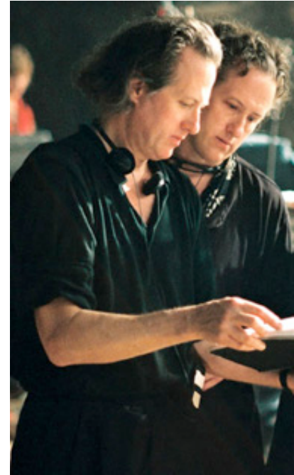
The Brothers Quay