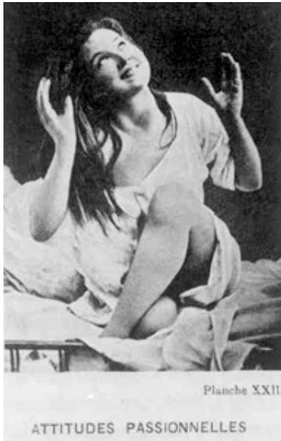
Attitudes passionnelles, from Iconographie photographique de la Salpetriere

discharge its excess amount of affect and the forces of repression countering this attempt. In order to evade repression, a transformation, or conversion, of energy from a primary to a secondary state occurs. The over-investment of the affected image transubstantiates from a highly charged primary state to a burdensome secondary state of physical suffering, as a painful hypersensitivity or a sensory-motor inhibition. Thus the transitory symptoms of the hysteric, which follow no regulatory pathological principles, are originally rooted in the dialectic between a fantasized (invisible, imaginary) body and an anatomical (visible, real) one. The insoluble conflict born out of an original trauma can only lead to the repression of the image of the affected organ and "its subsequent projection onto the eye, ear, or nose: a projection or displacement that explains – at the very basis of the phenomenon – the hyperbolic valorization of the organs of the senses and the dramatization of their functions" (20).