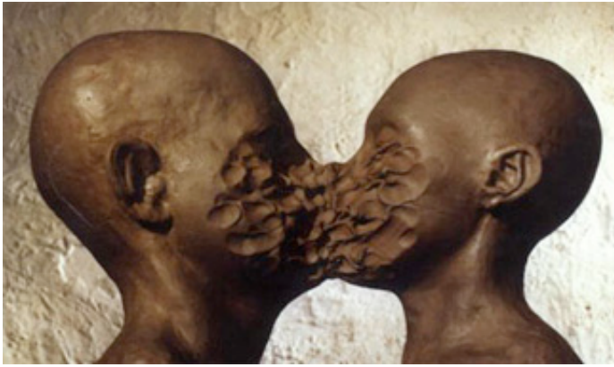
Dimensions of Dialogue

Jan Svankmajer used stop-motion animation primarily as a medium for dissolving disparities between facets of human life that are otherwise impossible to unify in a real, a-cinematographic context. In a film entitled Možnosti dialogu (Dimensions of Dialogue, 1982) , Svankmajer employs techniques mirroring paintings by Arcimboldo through which the distinction between masculine and feminine sexuality is ruptured. Jouissance as asexual and undifferentiated is portrayed through the dissolution of a clay male figure into a female body. In