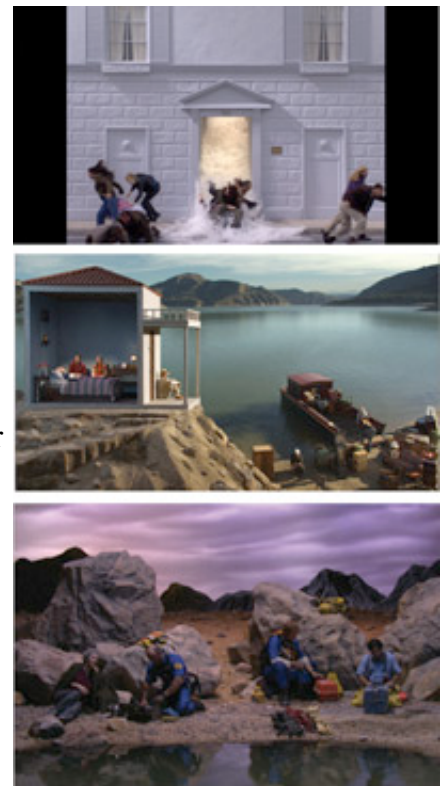
Viola spent years developing the scenes that comprise Going Forth By Day , which include (top to bottom): “The Deluge,” “The Voyage,” and “First Light.”

Meanwhile on the right-hand wall, two poignant scenes play out side-by-side, each projected 7½ feet high and about 10 feet wide. In the first, an old man lies dying while his possessions are loaded onto a boat in the distance — a boat that the man himself later boards for a voyage to an unknown shore. Projected alongside is a tableau suggesting a failed rescue effort following a flash flood. Long after emergency workers have abandoned hope, a drowned man rises unexpectedly from beneath the water and floats upward out of sight while the first light of dawn arrives. Within moments of this resurrection, the images on all four walls go black, and after a brief pause, the image cycle begins anew.