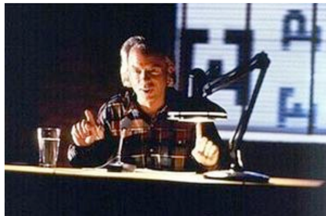
Gray in the 1996 film Gray's Anatomy