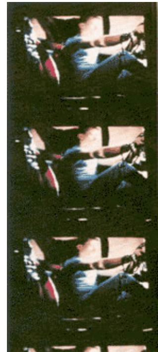
Kustom Kar Kommandos

Interview about the Hollywood Babylon publications.