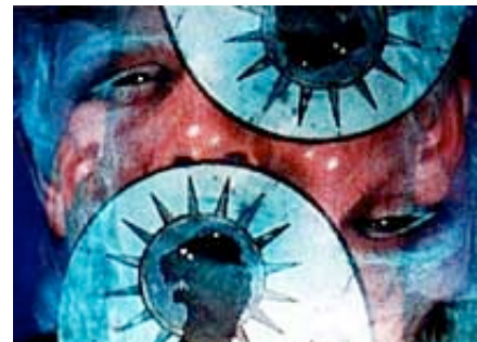
Invocation of My Demon Brother

His subsequent and latest film to date, Lucifer Rising is a departure from his previous major works. If Pleasure Dome , Scorpio Rising and Demon Brother remained fixated on death, Lucifer Rising is about rebirth, a celebration of the power of nature and of the ancient gods. It is a film of breathtaking beauty and power that supplants the closed worlds of Pleasure Dome and Scorpio Rising as well as Demon Brother's zone of all-pervading disorientation with an awesome sense of timelessness and spatial immensity, engendered at