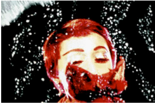
Inauguration of the Pleasure Dome

Babylon , his famous book about the seedier aspects of Hollywood history. In attempting to induce an altered state of consciousness in his viewers, Anger dispenses with traditional narrative devices, although his films definitely tell stories. Using powerful esoteric images and, especially in his later works, extremely complex editing strategies that frequently feature superimposition and the inclusion of subliminal images running just a few frames, Anger bypasses our rationality and appeals directly to our subconscious mind. The structure common to his major works is that of a ritual invoking or evoking spiritual forces, normally moving from a slow build up, resplendent with fetishistic detail, to a frenzied finale with the forces called forth running wild.