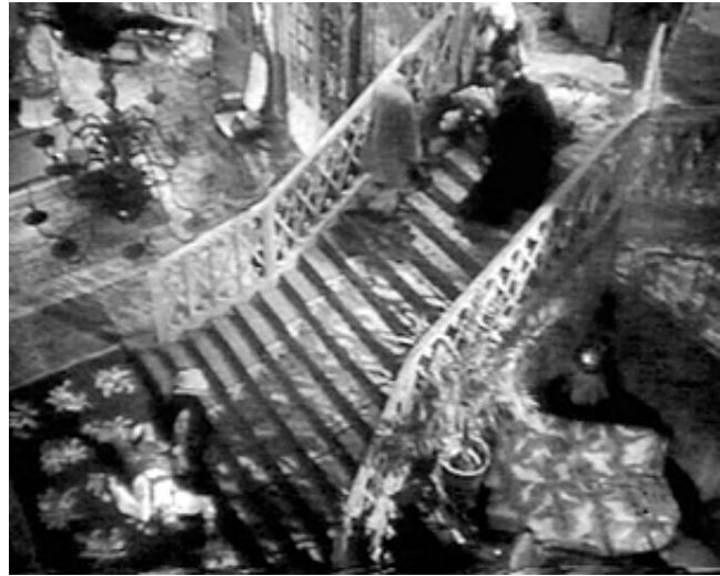
L'Aigle à deux tête

This stylistic conformity can be seen even more clearly in Cocteau's two subsequent films, both made in 1948 and based around his own plays. The first, L'Aigle à deux têtes ( The Eagle Has Two Heads ), traces the developing love affair between a queen and an assassin sent to kill her. The original play was set almost entirely in a single location. In the film, Cocteau opens the action out, including a number of exterior sequences. But this does nothing to lessen the film's theatricality. In addition, without the fantasy of Cocteau's two previous films, the result is no more than a well made but rather dull film version of an old-fashioned melodrama.