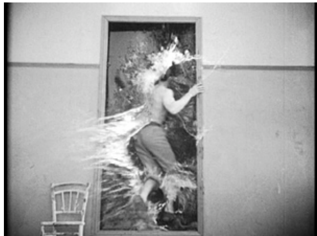
Le Sang d'un poète

Cocteau's implication that it did not occur to him to make another film is inadequate. Was he scared off by the controversy that his film generated? Did he consider another project but find himself unable to secure funding? Did he feel that he'd used up all his cinematic invention? Or was he still not that interested in film? In the absence of any clear evidence, one can only conjecture.