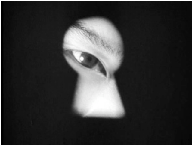
Le Sang d'un poète

In 1929, at the age of 40, Cocteau made his first film. The Vicomte de Noailles, a frequenter of avant-garde salons, asked Cocteau and composer George Auric if they would be interested in collaborating on an animation. Cocteau suggested they make a live-action piece instead. The news that he was making a film must, at the time, have seemed like further evidence of Cocteau's dilettantism (10). In fact, the result was an avant-garde landmark.